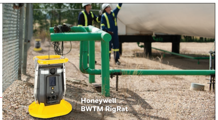
Honeywell BWTM RigRat