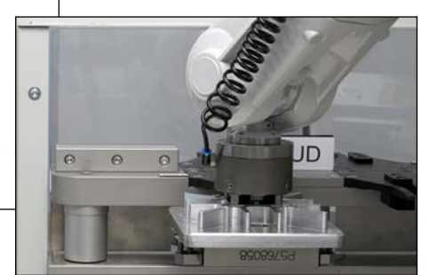
Example of part change