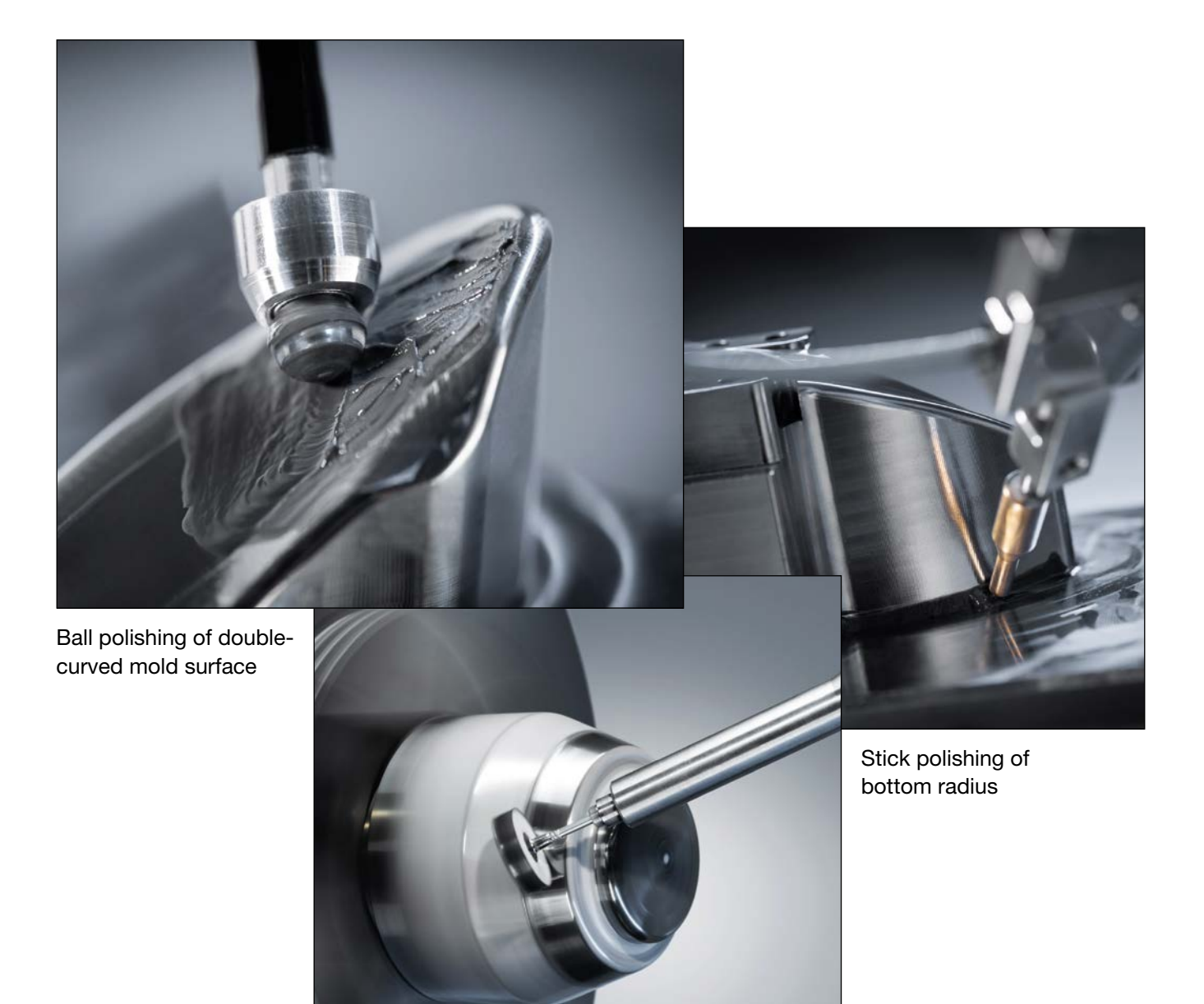
Polishing of a metal forming punch

Tools and Molds with 2D and 3D Geometries